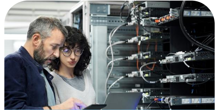
Security & Cloud Services